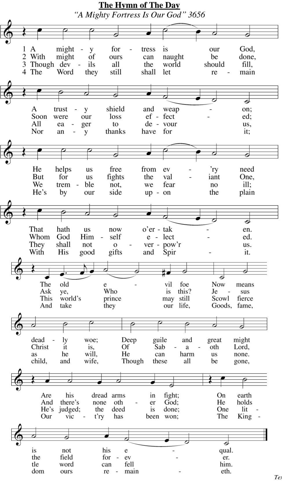
Text and tune: Public domain